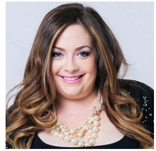
by Crystal Cave

Living More Starts with What You Choose to Put On In the Morning